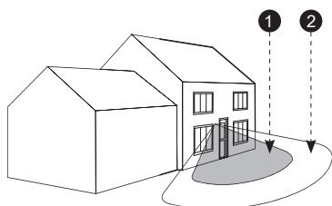
For optimum coverage recommended mounting height: 1m to 2.2m